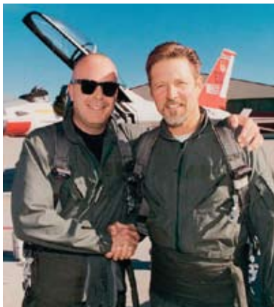
Jerry Doyle takes his friend Bruce Boxleitner, co-star from the Babylon 5 days, for a ride in an F-16.

By 2004, however, he had his own program, “The Jerry Doyle Show,” which today averages 3.25 million listeners a week on 230 stations, and is the eighth largest talk radio show in the country.